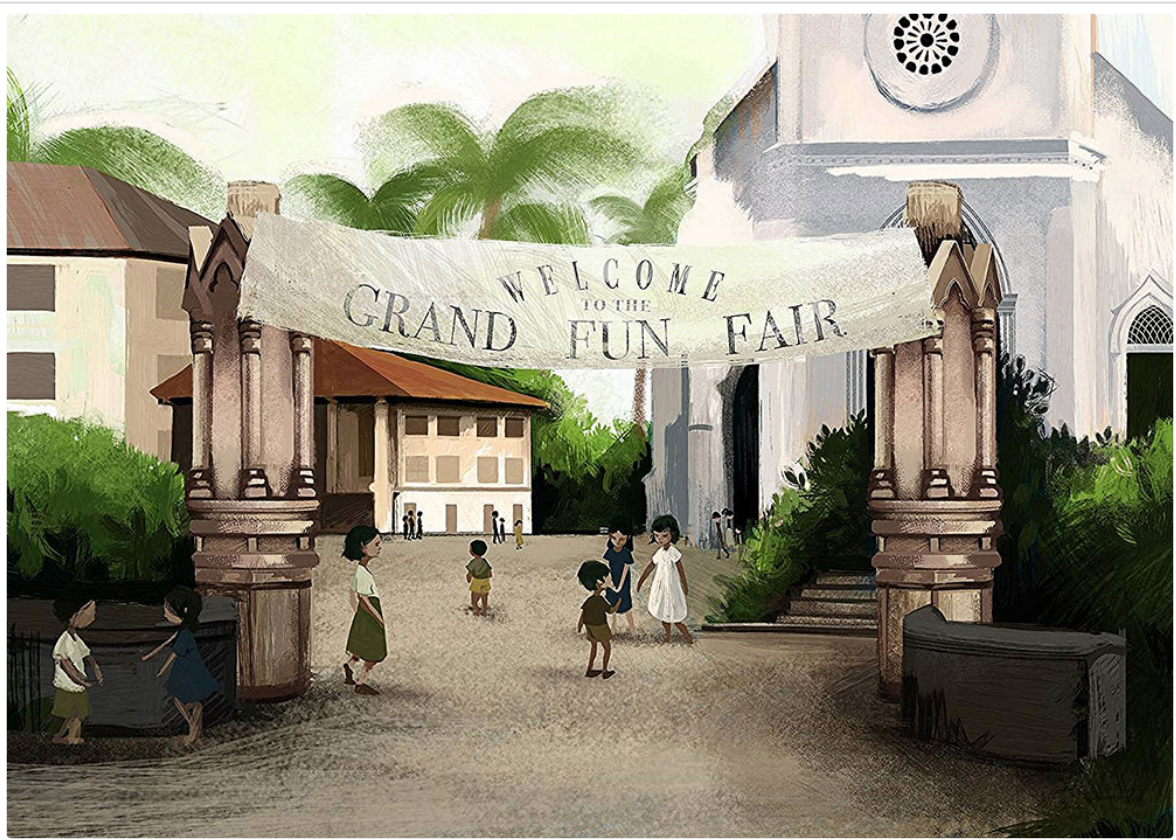
Artist impression of fun fair at Montfort school.